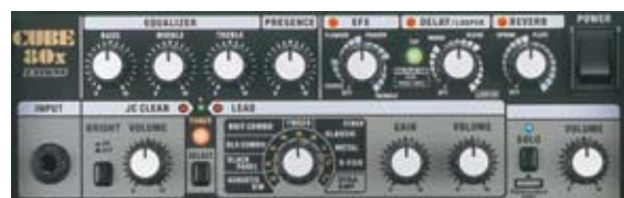
■ Top Panel